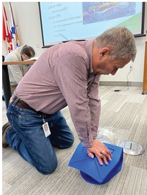
ENS Staff CPR Training, May 2022.

In November 2022 100% of ENS staff had responded to the survey. The results of which will inform the work of the Human Resource Strategy Committee for the 2023–2024 fiscal year.