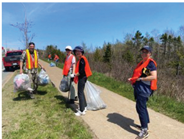
ENS Staff Great Nova Scotia Pick-Me-Up, May 2022.

In 2022 the Human Resource Strategy Committee successfully completed the implementation of all recommendations from the HR Plan, which focused on communication, training, recognition, and collaboration. The next step was to await the results from the 2022 ‘How’s Work Going?’ survey.