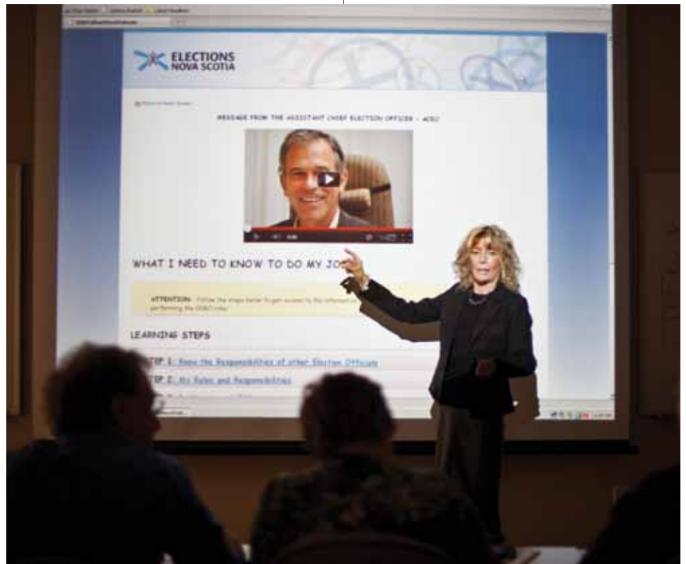
Elections Nova Scotia's new online training system provides a uniform training program across the province.

The content of the new learning management system has been integrated with the new Election Day Handbook to provide a uniform training program that can easily be delivered anywhere in the province.