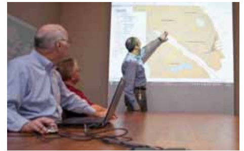
The work of the Electoral Boundaries Commission will be aided by a new electronic tool designed by Elections Nova Scotia.

the next general election. As well, Elections Nova Scotia will conduct a merit-based selection process to choose and appoint returning officers in each of the electoral districts for the next general election.