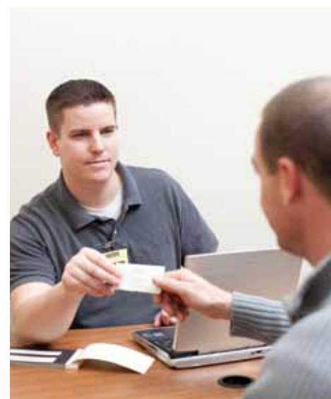
Nova Scotians can vote on election day, at the advance polls, the continuous poll, the out-of-district poll or by mail.

The elector can then vote using the write-in ballot; the liaison officer will return the ballot envelope and ballot to Elections Nova Scotia. Once received, the ballot is sent to the appropriate returning office where it will be counted on election day.