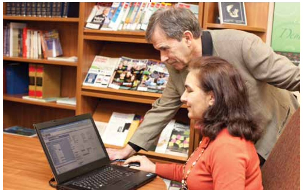
The election Management System was designed by Elections Nova Scotia and will be enhanced over time by integrating new modules.

reporting election night results (preliminary results from the field), managing election officers payroll, and incorporating geographic information system tools to validate civic and mailing addresses, and manage polling stations.