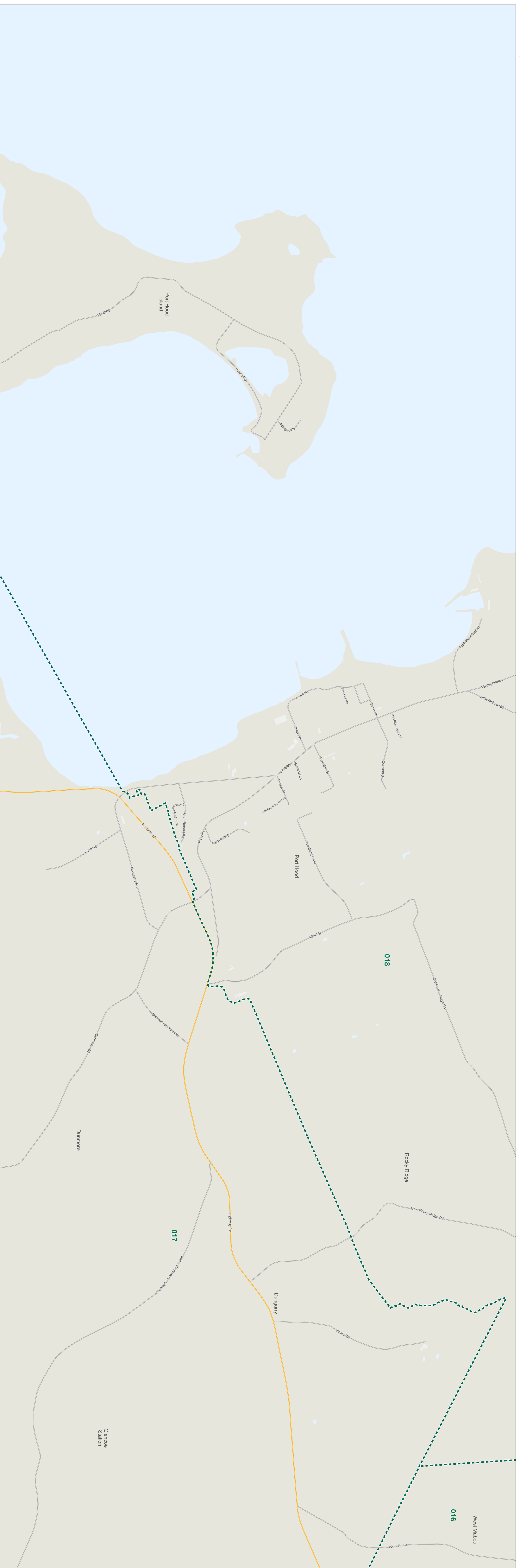
Port Hood Inset - 1:3,100